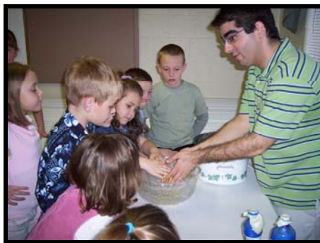
Earth, Wind & Wonder is one of the activities to help children understand the awesome power of God.

Once music concludes, the classroom is divided into three groups usually based on age. The first group will remain for the