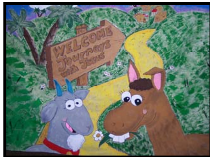
Join us, Gouda the goat and Bartholomule the mule, for a great Journey with Jesus!

Through the variety of ways of teaching a biblical principal, our goal is for your child to have learned something new about how God's Word applies to him or her even today!