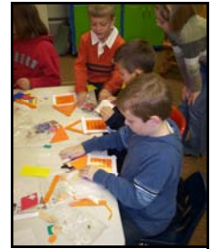
Crafts keep every child engaged.

Lesson which is conducted in the Music Classroom. Another group will rotate to Games, and the third group will rotate to Craft. Each of these break out sessions last for approximately 15 minutes before they rotate to the next activity.