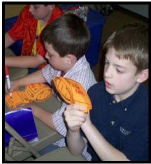
Children share their prayers and praises by writing them on special cut-outs to be shared with the rest of the class.

Children's Church is a program for all children up through Grade 5. While you, the parent, are praising and worshipping God during the morning service, your child will be praising, worshipping and learning about God in a fun, kid-friendly setting.